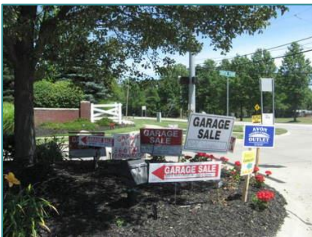
Sign clutter is unsightly